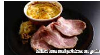
Boiled ham and potatoes au gratin