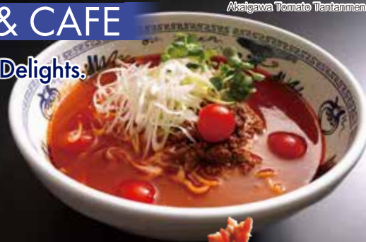
Akaigawa Tomato Tantanmen