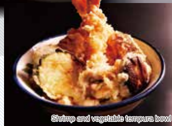
Shrimp and vegetable tempura bowl